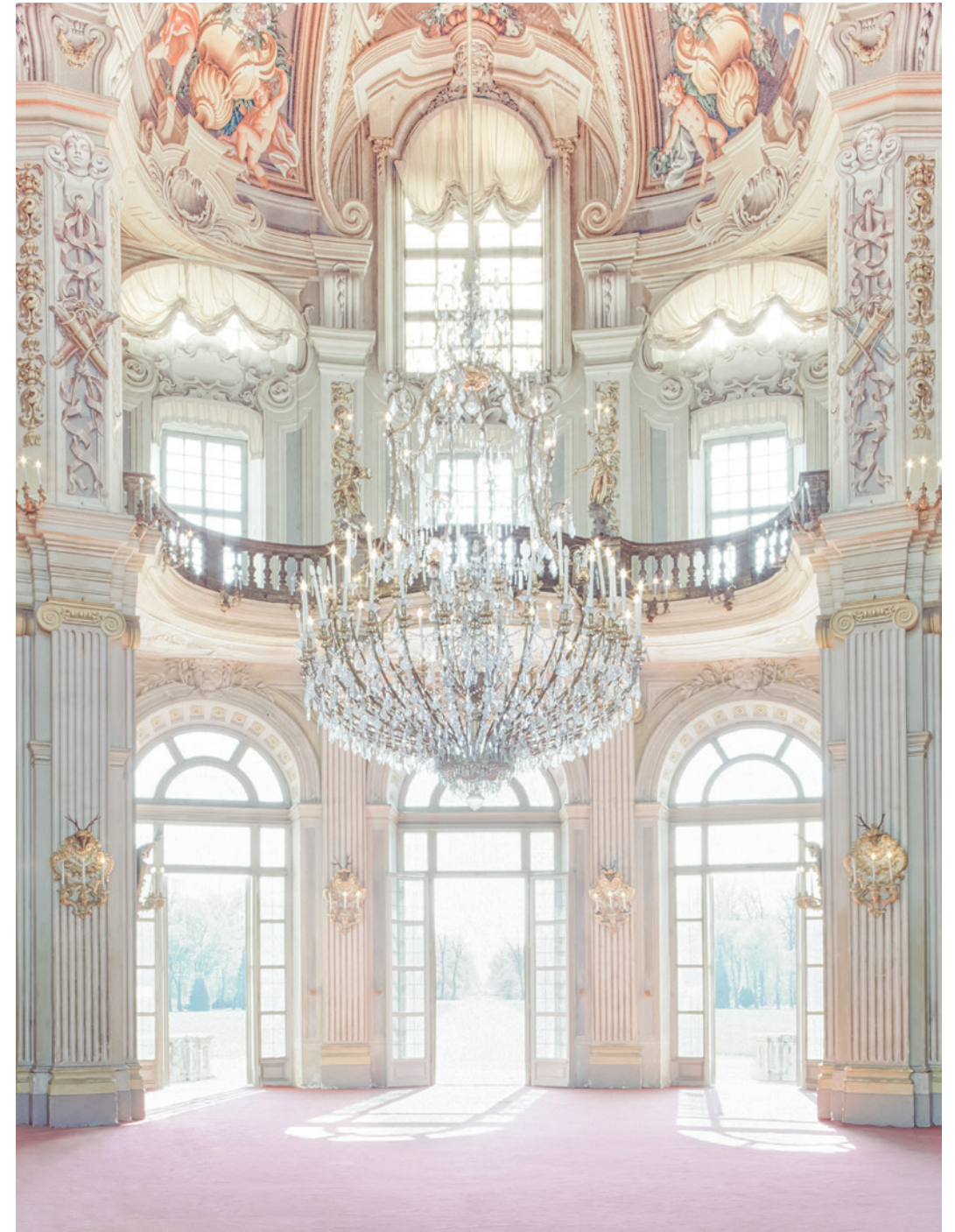
Stupinigi Hunting Lodge - Turin