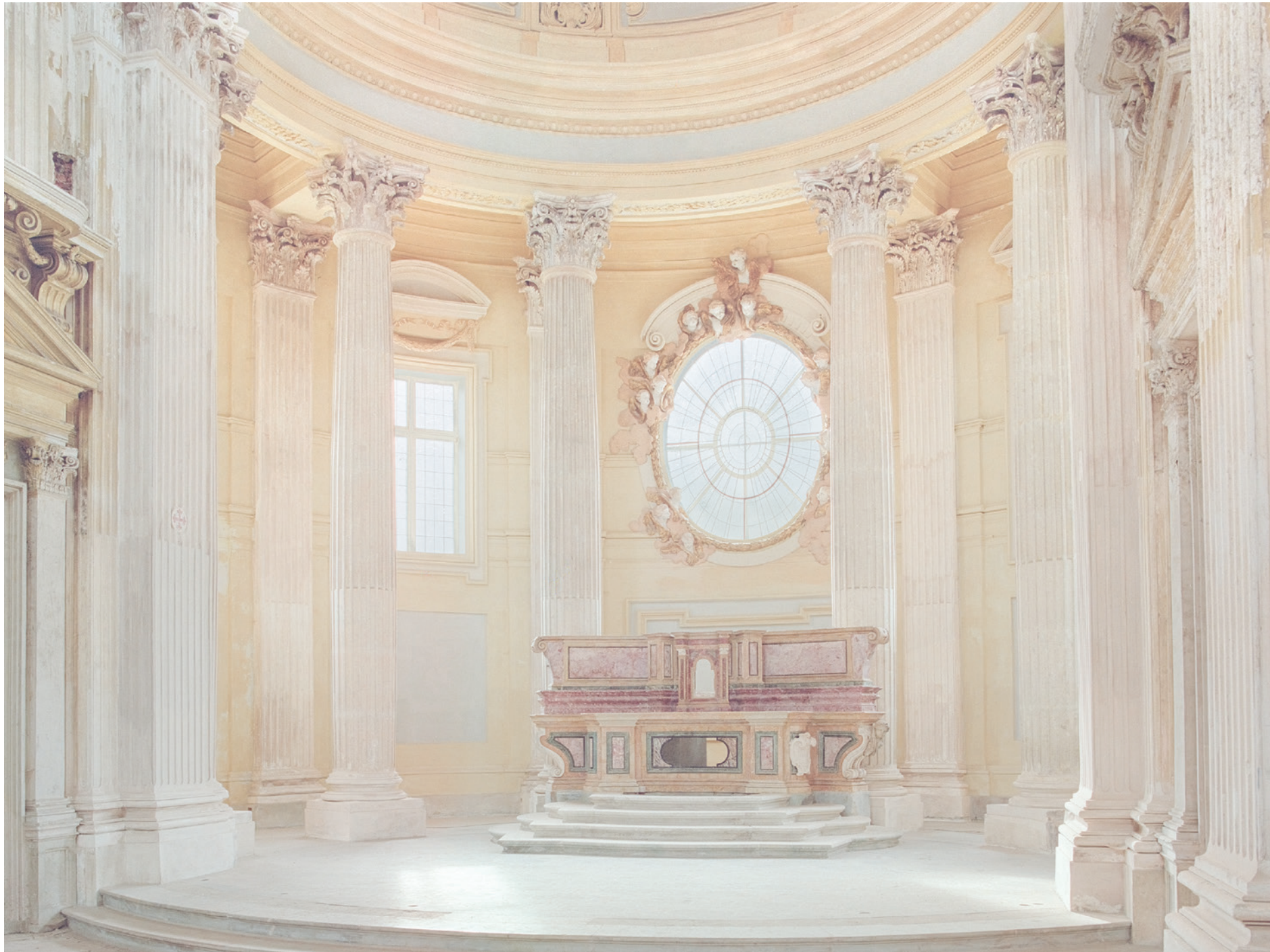
Church of Sant'Uberto - Royal Palace of Venaria Reale