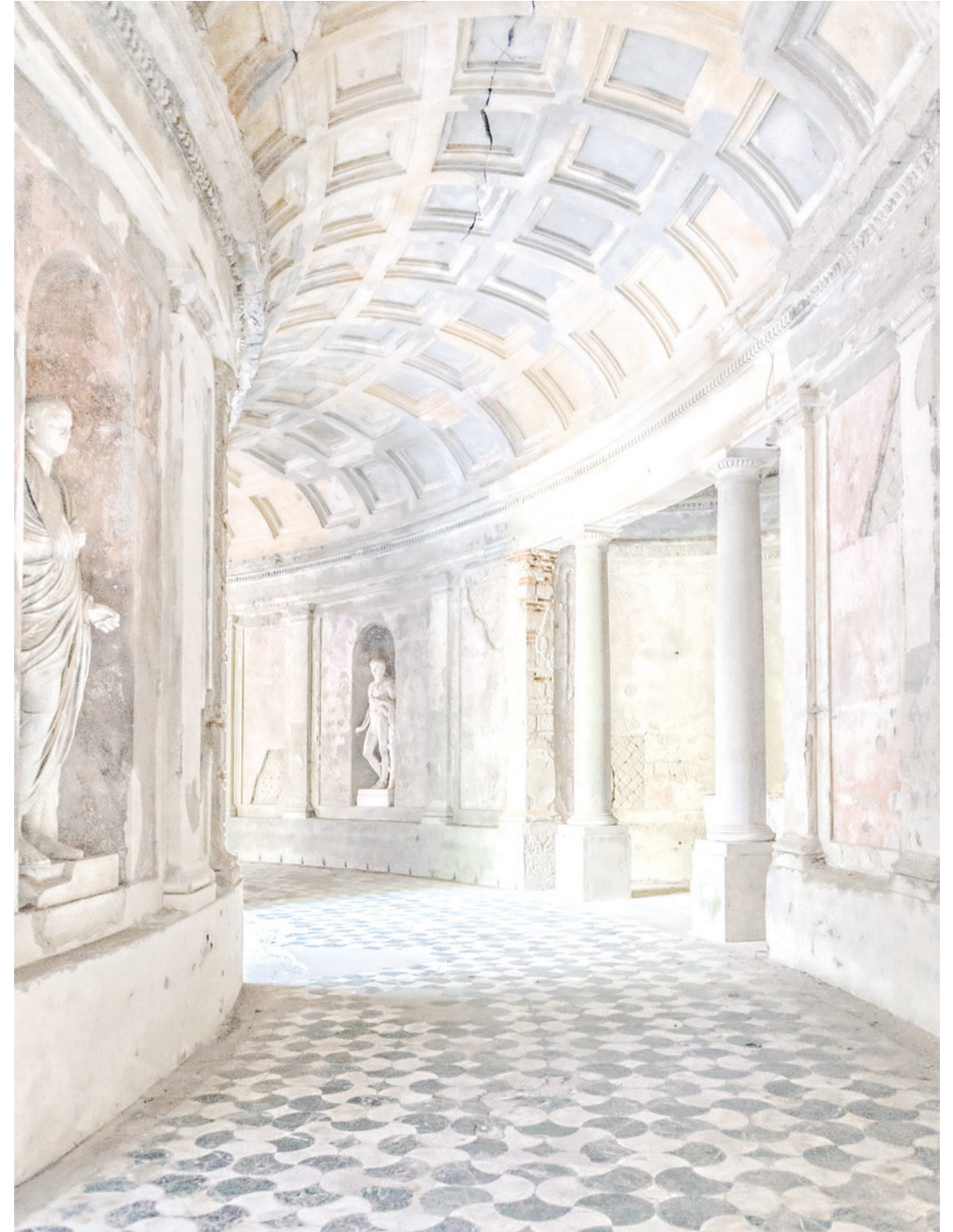
Royal Palace of Caserta - Caserta