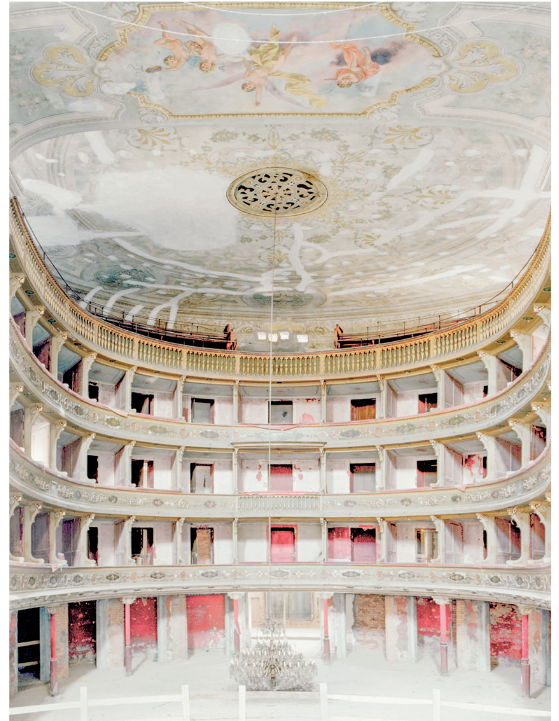
Italia Theatre - Valenza, Alessandria