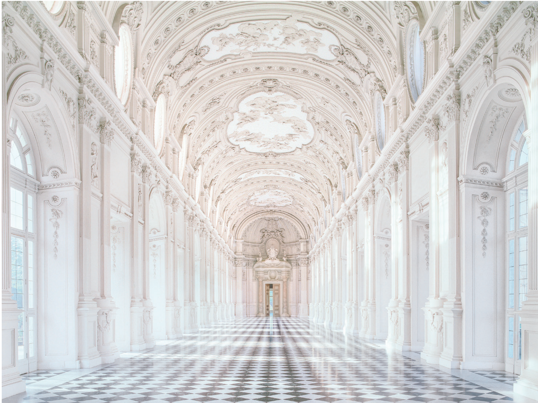
Diana Gallery - Royal Palace of Venaria Reale