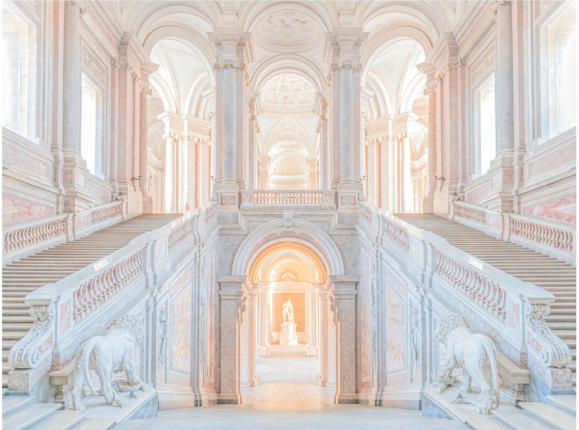
Royal Palace of Caserta - Caserta